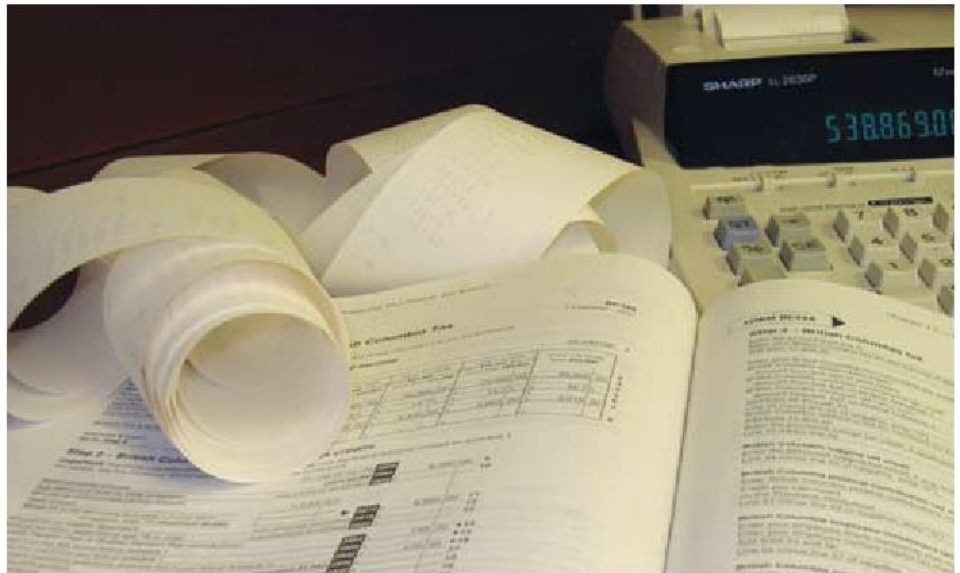
Count on us to account for you